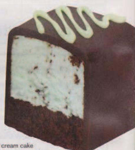
■ A small-bite ice cream cake from Baskin-Robbins comes in four flavors and sells for about $3.